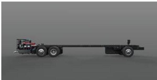
Spartan RV_K3 525

The K3 525 chassis from Spartan RV Chassis, designed exclusively for the 2024 Newmar Mountain Aire Class A diesel luxury motorcoach.